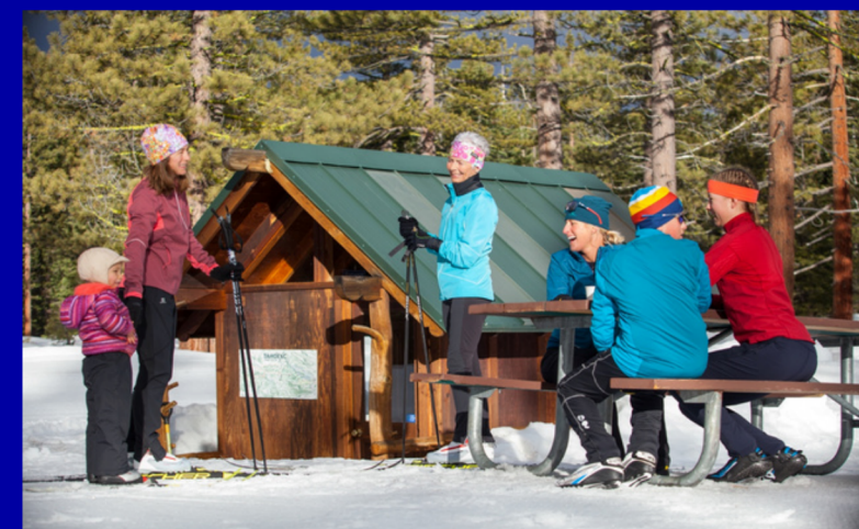
Connect with Friends